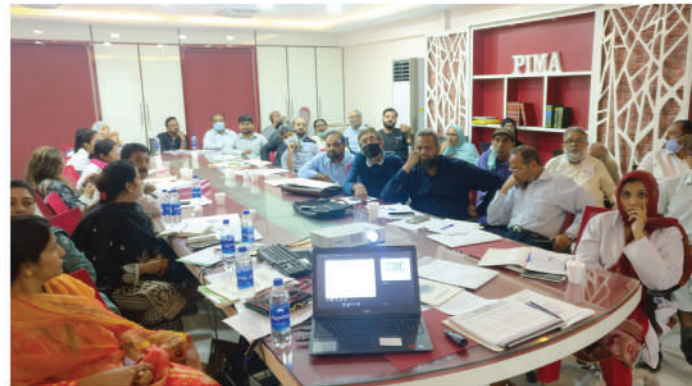
Training session of General Practitioners on Sindh Service Delivery Standards (SSDS) for GP clinics at Karachi