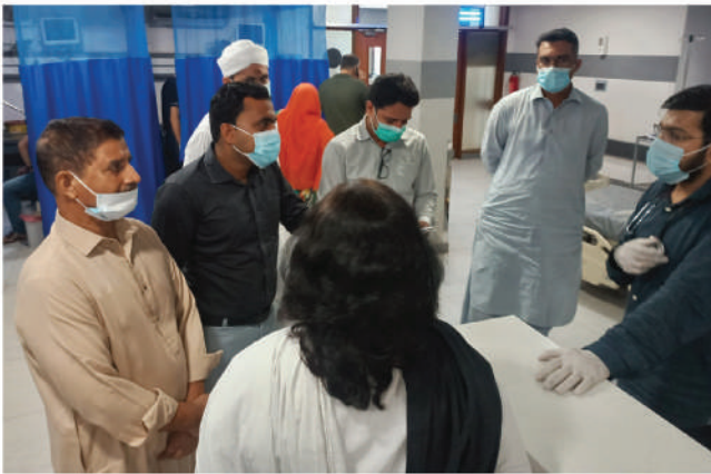
Antiquackery team visiting a clinic at Karachi