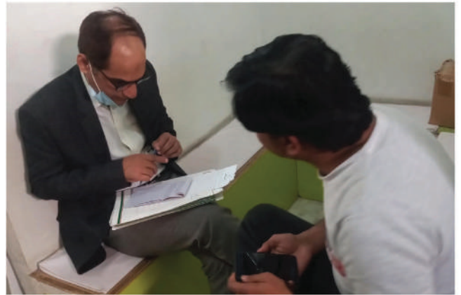
Antiquackery team filling required legal documents as evidence