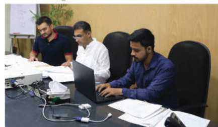
Burning the midnight oil, during SHCC recruitment drive at SHCC Head Office