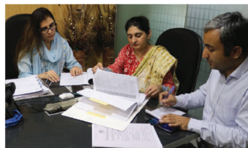
Consultative session on SHCC's Monitoring & Evaluation policy/strategy with recently hired members of Monitoring and Evaluation Directorate at Karachi office