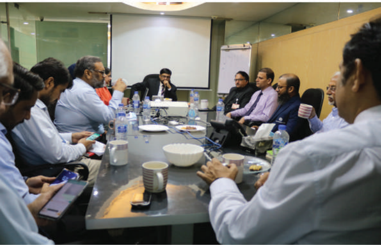
14th September 2022: Meeting of CEO, Sindh Healthcare Commission with management of major private hospitals and laboratories operating in Sindh at SHCC Head Office

T There is significant increase of Dengue and Malaria cases witnessed in Sindh as a result of havoc caused by spells of rains and flash floods, which led to uncontrolled spread of vector borne diseases. CEO, Sindh Healthcare Commission called an urgent meeting with management of major private hospitals and laboratories operating in Sindh on 14th September, 2022 at SHCC office, to discuss and develop strategy to provide relief to suffering masses. It was observed that private hospitals and laboratories were charging different prices for the same tests. In this regard, a reduction in the prices of high-volume common tests for Malaria & Dengue was discussed in detail, in order to provide immediate relief and to decrease the financial burden on patients. The existing / current rates for the tests for dengue NS1 antigen had been charged from Rs. 1,460 to Rs. 3,000, which has now been reduced to Rs. 850. The tests for Platelet Count were charged at Rs. 430 to Rs. 550, which now has been reduced to Rs. 250 and for the test of ICT