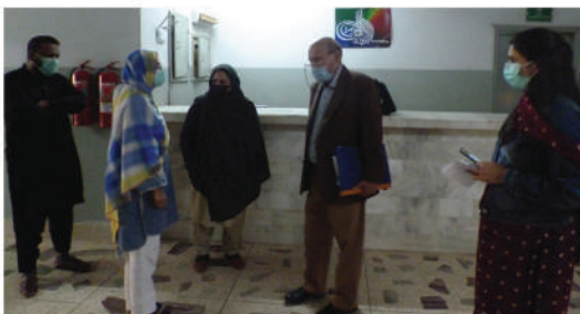
Inspection of HCE before process of complaint hearing