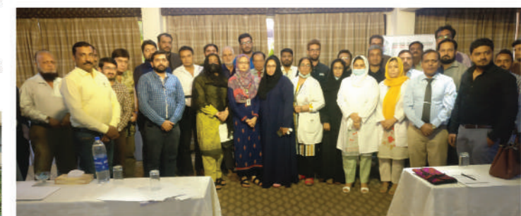
Group photo of health providers during training session on "Standards for Hospitals"