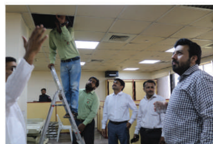
Administration team hard at work during office renovation and IT networking at SHCC Head office