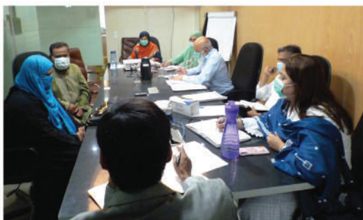
Complaints hearing process at SHCC Directorate of Complaints at SHCC Head Office Karachi