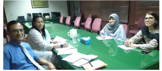
Medicare Cardiac Hospital

The primary objective of these visits was to explore a long-term and mutually effective partnership. These visits marked a significant step in strengthening the collaboration between SHCC and the HCEs, with the intent of improving healthcare services and outcomes. The SHCC teams discussed the Key Performance Indicators (KPIs) for HCEs and shared the mechanism of recording and reporting.