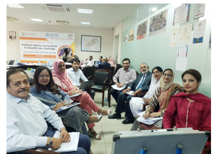
National Consultation on Curriculum for Patient Safety 12 July 2023