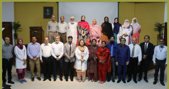
CEO SHCC at DUHS attended a session to discuss quality care standards implementation in Sindh.