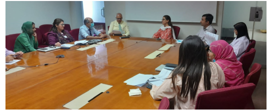
The Agha Khan University Hospital