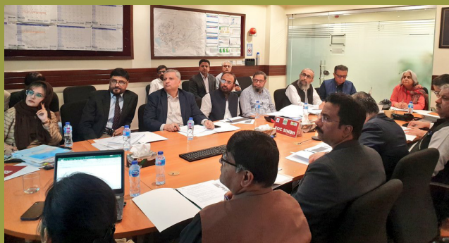
CEO SHCC attending a meeting chaired by Health Minister Dr. Azra Pechuho for review of National Health Support Program (NHSP) implementation in Sindh.