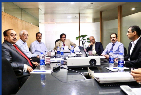
62 nd meeting of BoC approved MSDS for Dental Health Facilities & Diagnostic Laboratories

A consultation meeting was held on 18 December 2023, of relevant stakeholders on the draft of the MSDS for Family Planning. Key recommendations and comments of participants were recorded and incorporated to develop the final document which has been shared with stakeholders for final review and approval. SHCC appreciated the role of collaborating partners for sponsoring the event.